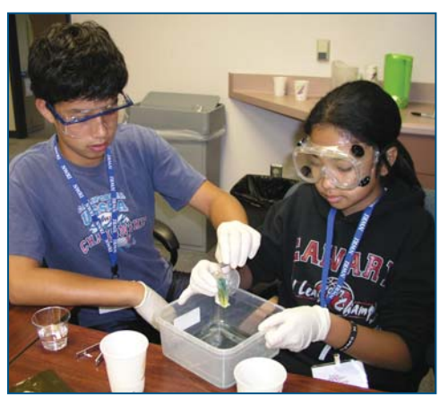
With the help of the Discovery Science Center, campers learned to sample water for nitrates, pH, and phosphates at Water Camp headquarters before taking their work to the field at the San Joaquin Marsh and Wildlife Sanctuary, the largest coastal freshwater wetlands reserve in Southern California.

O.C. Water Camp is an educational summer program that uses hands-on activities to engage young people's interest in